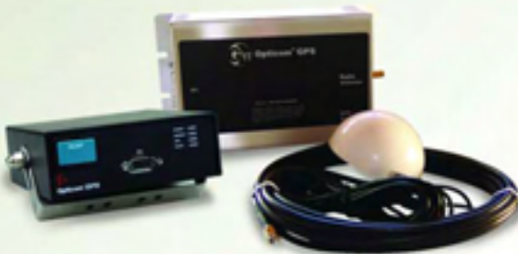
Opticom™ GPS System Vehicle Kit: Opticom™ Model 1020 or 1021 GPS Vehicle Control Unit, Opticom™ Model 1012 GPS Radio Unit, Opticom™ Model 1050 GPS/Radio Antenna