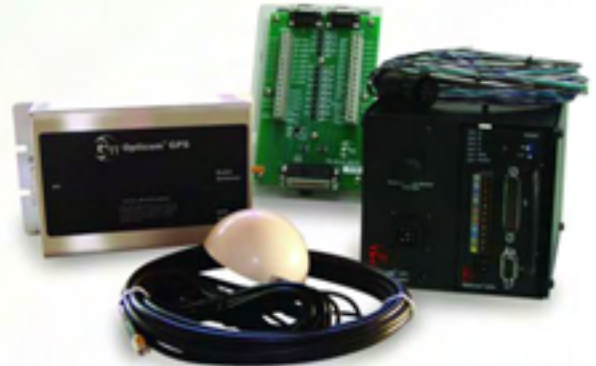
Opticom™ GPS System Intersection Equipment Matched Components – Cabinet Mount: Opticom™ Model 1012 GPS Radio Unit, Opticom™ Model 1050 GPS/Radio Antenna, Opticom™ Model 1030 GPS Auxiliary Interface Panel, Opticom™ Model 1000 GPS Phase Selector

Contact Global Traffic Technologies to learn more about service, maintenance and turnkey solutions in emergency vehicle preemption and transit signal priority that improve the quality of life for everyone in the community. Call 1-800-258-4610 , or visit us at gtt.com . The method of using the components of the Opticom™ GPS System may be covered by U.S. Patent Number 5,539,398 and Canada Patent Number 2,178,339. The use of Opticom GPS System components may be covered under one or more of the following U.S. Patent Numbers: 5,602,739; 5,926,113; 5,986,575; 6,243,026.