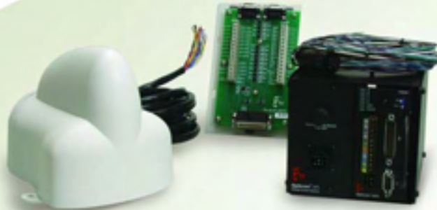
Opticom™ GPS System Intersection Equipment Matched Components – Pole Mount: Opticom™ Model 1010 GPS Radio Unit, Opticom™ Model 1030 GPS Auxiliary Interface Panel, Opticom™ Model 1000 GPS Phase Selector